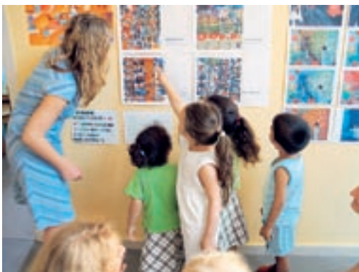
The children choose their favourites from the preliminary designs submitted by the 'Baupiloten.'