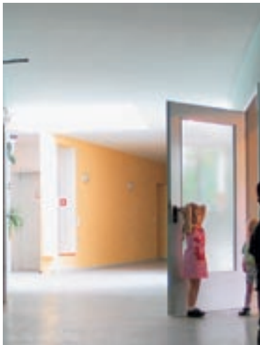
Atrium and corridors of the 'Tree of Dreams' Kindergarten in Berlin-Kreuzberg before (left) and after reconstruction (right).

For their second project, the 'Tree of Dreams' Kindergarten in Berlin-Kreuzberg, the 'Baupiloten' followed a similar approach. In this case the cost limit for renovation work was even lower than it had been to reconstruct the school. Children attending the kindergarten range in age from 2-11 years. They produced pictures and models to depict their visions of a 'Tree of Dreams.' The youngest amongst them were not yet able to express themselves in language but were able to communicate through their pictures: the 'Tree of Dreams' would be their companion and playmate. The images and wishes of the children again served to inspire the work of the 'Baupiloten.' They designed structures and shapes representative of a tree, offering protective nooks and crannies to snuggle into. The 'Tree of Dreams' encourages children from a wide variety of cultural backgrounds to come together. As they arrive, the tree greets them in their 14 different languages. It works like a mythical creature that has become real, stimulating the children's imagination and social skills, and encouraging them to play and communicate in smaller or larger groups. It glitters and glows, moves and makes noises. Its leafy roof reflects natural light deep into hitherto insufficiently lit corridors, its