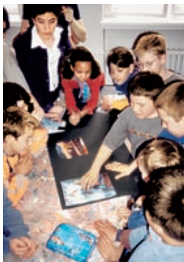
Start of the 'Silver Dragon Worlds' project: Collage workshop with the children of the 'School Committee'

The students and schoolchildren created the 'World of the Silver Dragon' to form the basis of a playful and expressive architecture. As they enter the building, visitors are greeted by a small exhibition of the children's work on the theme of the 'World of the Silver Dragon'. A gallery on the ground floor and in one of the stairwells presents a constantly changing display of the children's current work. The further you go into the school building the more strongly you feel the spirit of the Silver Dragon: a spirit which changes, resonates, glows and shimmers. On the ground floor, in the world of 'star dust diving,' plants grow under violet light above yellow-green lacquered metal furniture, providing the imaginary dragon with a place to sleep. On the first floor in the 'breath of gentle air,' the breath of the dragon becomes perceptible between the light translucent veils of the ceiling and the shimmering textile wardrobes. The second floor houses the 'throne on the beat of the wings,' where groups of four children sit on folding seats in the crook of the dragon's wing to read, work and chat. Finally, on the third floor you can 'fly with the dragon.' The children learn