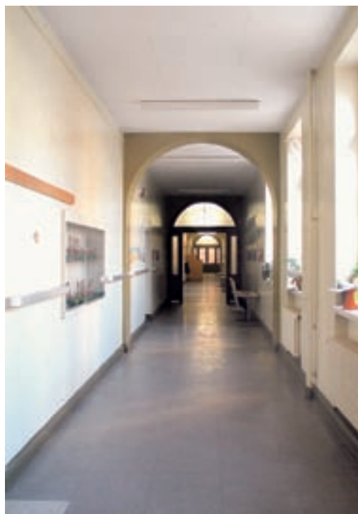
The hallway of the Erika Mann Elementary School in Berlin-Wedding before and after conversion with its inviting foldable seating.