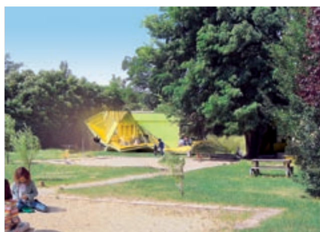
The Taka-Tuka Land Kindergarten in Berlin-Spandau before and after renovation, view from the garden

The children's reactions during the design phases and after completion of the three projects confirmed how important it had been for the design work to take explicit account of the atmospheric effects produced by the architecture. It was also essential to ensure that these effects were monitored and reflected throughout the building process. Because the children had been so closely involved in the design process, they were able to identify strongly with their newly created environment.