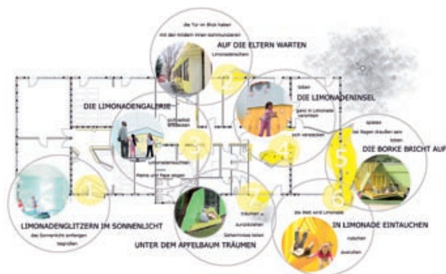
The children present their visions of Taka-Tuka Land.

The kindergarten building is interpreted as Pippi Longstocking's ancient oak tree in which lemonade is made. The children can experience the 'lemonade' spatially at seven activity stations.