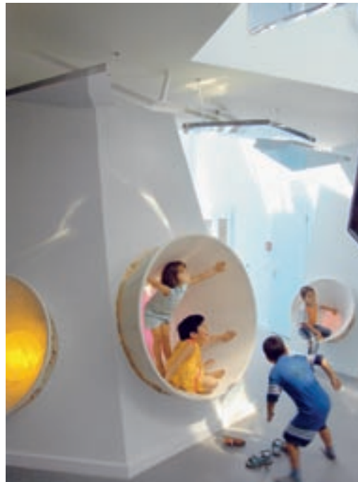
The children romp in the flowery bowers and swings of the 'Tree of Dreams.'